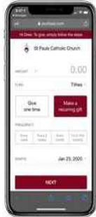
Mobile Text: "SPCC" To: 77977